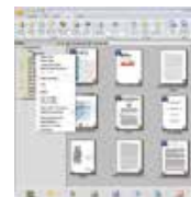
The PaperPort SE14 main screen

- The Professional Choice to Organize and Share Your Documents