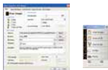
The Button Manager V2 main screen

Button Manager V2 makes it easy for you to scan and send your image to your favorite destinations with a press one button. Now the new version comes with an innovative feature to let you scan and automatically upload the scanned document to popular cloud repositories such as Google Docs, Microsoft SharePoint, or FTP. In addition, the iScan feature allows you to insert the scanned image or recognized text after optional OCR (Optical Character Recognition) process to your text editor such as Microsoft Word to get your job done easily and quickly.