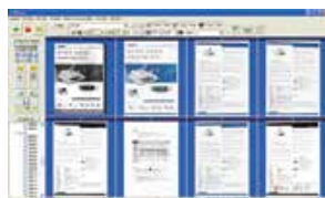
The AVScan X main screen

-The Intelligent Document Management Tool